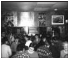
Sat. June 3/06 - Patio Party Sat. Dec. 2/06 - XMAS You can also join at the door! (Call for 2007 Party Dates)