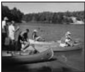
Indoor & Outdoor Events Call or see our Web page for dates. Call us for New Year's Eve details & Location. We have Group Tickets!