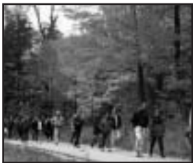
Fun Park walks - Sat. & Sun. Just show up to join us!