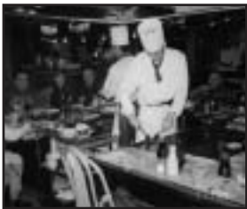
RSVP Dinner Dates or Bands See 3rd Friday of the Month